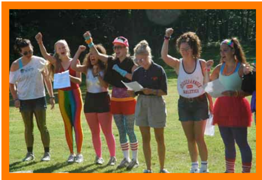
1986 Day to Celebrate S4G 25th Anniversary

I am always trying to find the perfect metaphor (or simile) for the Camp experience, but it is so elusive. At the end of each session we all sit on the dock and put our candles in the water. We sit and talk with each other as we try to explain why Camp is so special. We laugh and we cry. We think about how short our time at Camp is and how amazing it is that it becomes part of us in those few weeks that we have together. I decided this year that I could best describe it as magical . I hope that you take time to think about those magical weeks you spent at Camp as spring begins to bloom. And if you can, join us this summer and make some new memories with us.