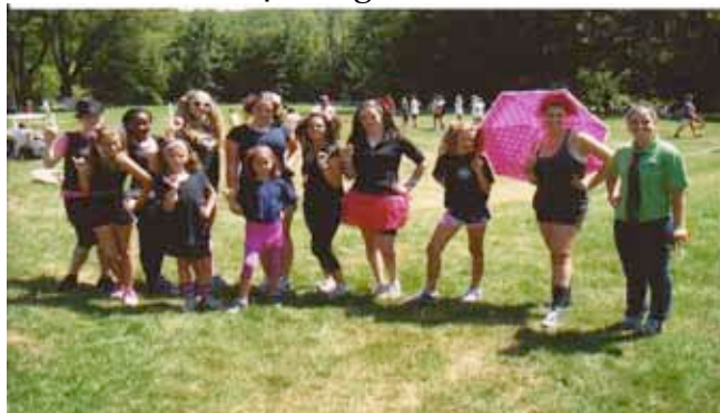
Pretty Poodles competing in the S4G Dog Show