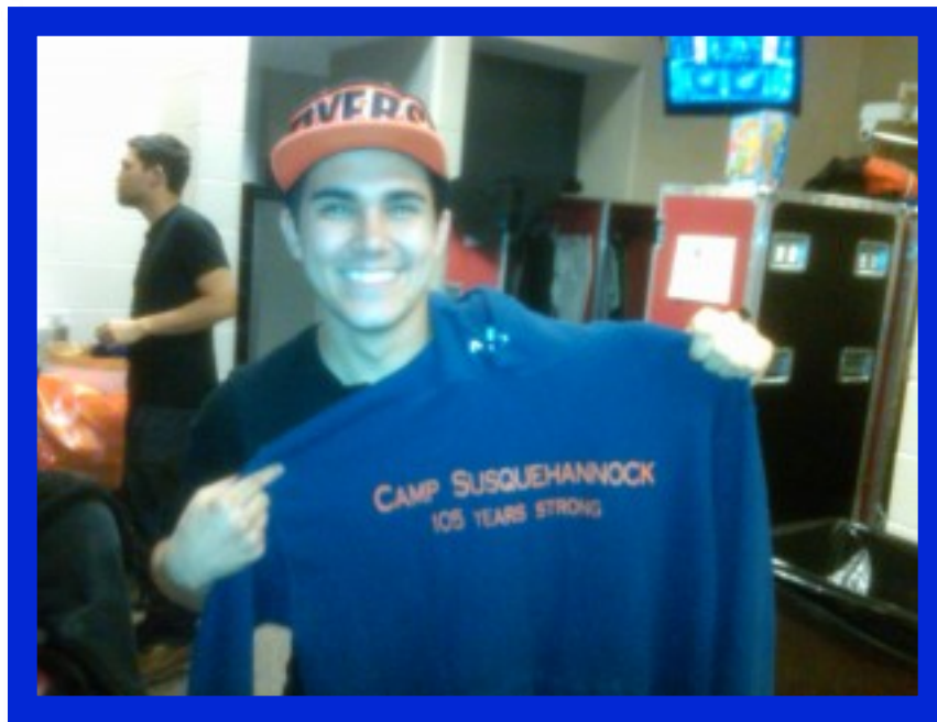
Carlos Pena '99 visiting the Wells Fargo Center in Philadelphia, PA

During a recent Big Time Rush performance in Philadelphia, PA, Carlos Pena '99 took a moment out of his busy touring schedule to show off his Susquehannock hooded sweatshirt that travels with him. Carlos also generously autographed a photo of Tripp Lake, which is the Grand Prize in our “Never Leave Home Without It” contest