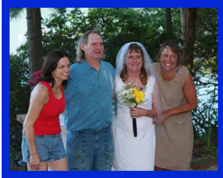
Our wonderful kitchen staff